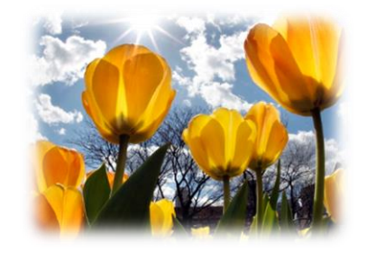
Class 2 (Year 1 and 2)