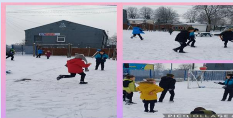
Children having fun in the snow.

With this unpredictable weather, please ensure your children always come to school in a warm coat hat, scarf, gloves etc, please can these be labelled. All children are encouraged to play outdoors at break and lunchtimes even in cold weather and need to be dressed appropriately. Thankyou