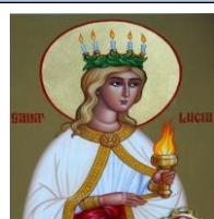
Class 2 :Retell