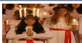
EYFS- St Lucy story