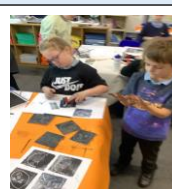
Class 3 – screen printing