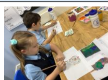
Class 2 - Pointillism