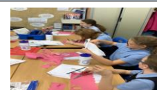
Class 4-Art Day