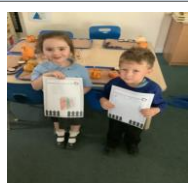
EYFS – our Art day